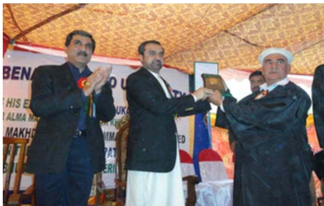
Vice Chancellor presenting shields to the guests