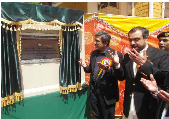
The formal inauguration of Shaheed BB University by the Governor of KP