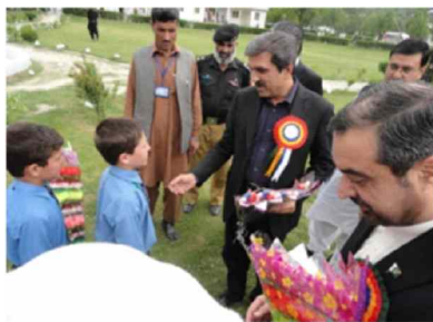
Kids presenting flowers