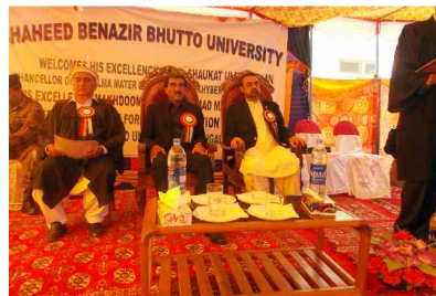
Guests on stage